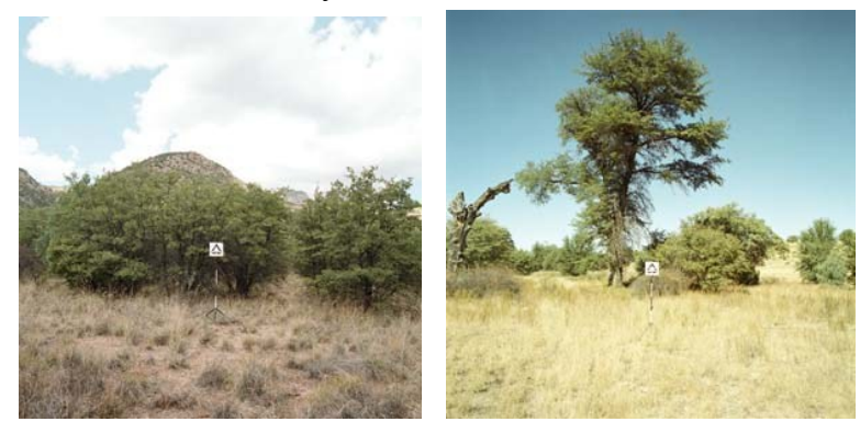
Examples of photos taken from the Digital Photo Series

The main advantage of using photo series is that it is relatively easy to learn and doesn't require a great deal of investment in time or resources. A disadvantage of using photo series is that live surface fuels may not always be visible in the photographs. For this reason, using the photo load method may be more appropriate for live surface fuels. In addition, photo series are not available for all vegetation types and photo load series are not available for all plant species. Thus, this method is not available in all instances. Although, with the development of the fuel characteristic classification system and the digital photo series, the range of vegetation types with associated photo series has greatly expanded. It is important to note that even if a photo series is available for vegetation type of interest, it may not reflect the appropriate season or successional stage. Thus, it should always be used with caution.