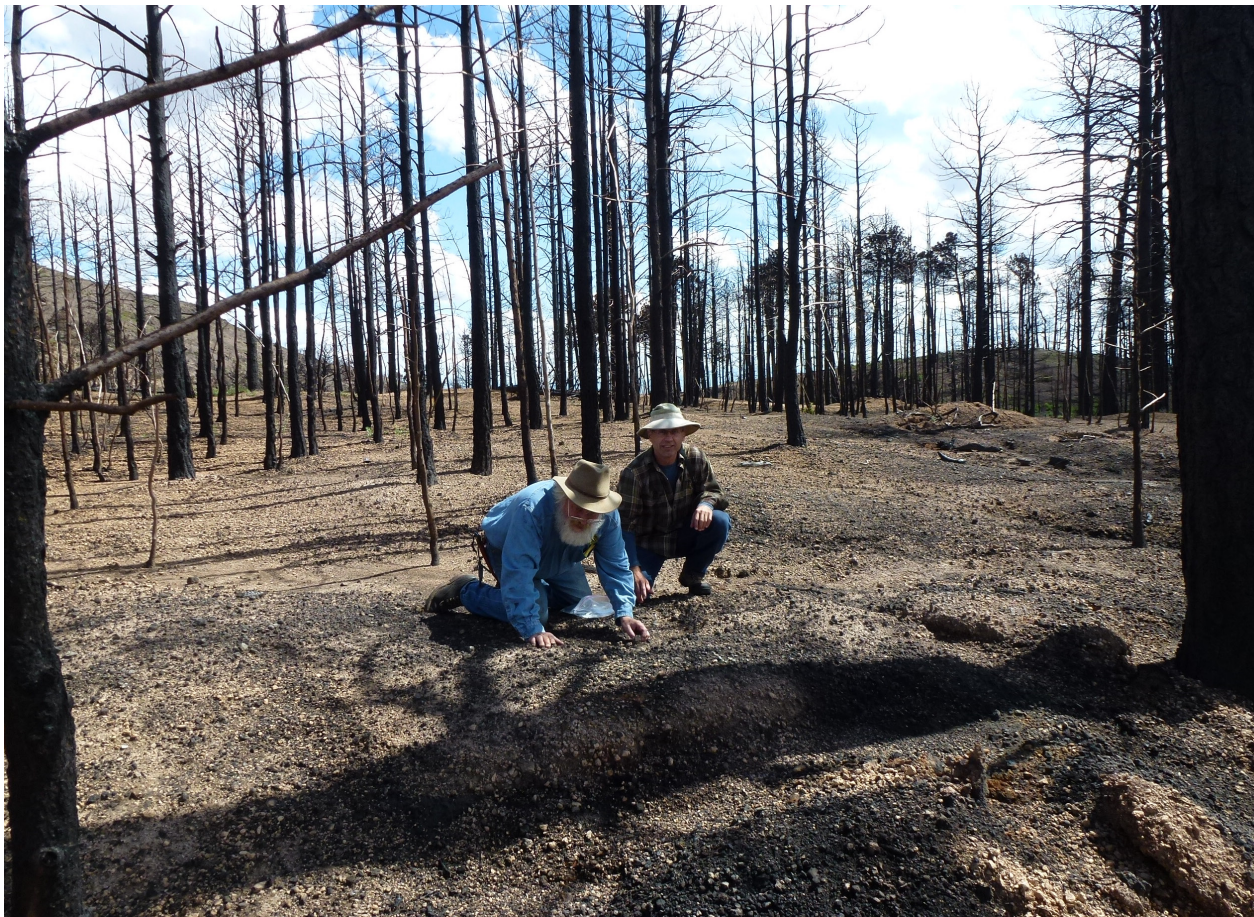
Figure 1: Wind driven crown fires consume surface detritus, needles and fine branches but leave heavier woody fuels intact. Above, the Las Conchas Fire incinerated more than 30,000 acres of timber in a single burning period near Cochiti Mesa, Santa Fe National Forest, in summer 2011.

C ac -1 . Such a large value rivals wet temperate coastal conifer forests (Smith et al. 2006) and suggests some old growth southwestern forest stands may hold more carbon than has been previously reported. The largest trees in southwestern forests tend to grow on lower topographic positions, e.g. drainage bottoms near an available groundwater subsidy, and in locations free of high-severity fire and logging during the modern era.