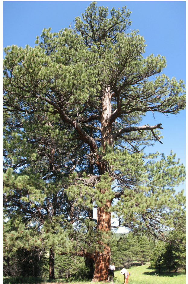
Figure 3: A large ponderosa pine in the Valles Caldera National Preserve, NM. The lateral branches are larger in diameter than the boles of any tree in its vicinity. The tree also exhibits vertical sub-leaders that grow upright on branches adjacent the main trunk.

Carbon stocks in ponderosa forest are reported to average 19.8 to 30.1 t C ac -1 on the Mogollon Rim (Finkral and Evans 2008, Sorensen et al. 2011). Dore et al. (2010) measured ~55 t C ac -1 for an undisturbed stand, and 39.4 t C ac -1 in a recently thinned stand in central Arizona. Other studies in the Madrean Sky Islands found 57 t C ac -1 (Whittaker and Niering 1975,