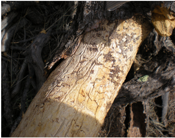
Figure 2: Bark beetle galleries.