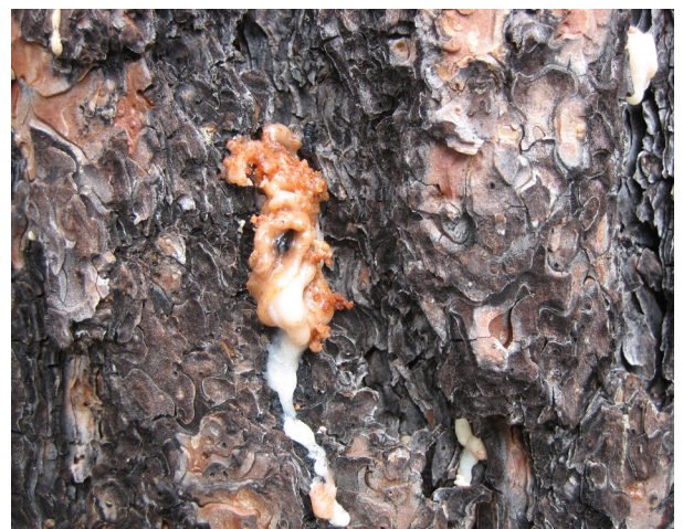
Figure 1: Pitch tube and frass in bark crevices on a ponderosa pine tree.

temperature will likely have a direct impact on the beetle itself whereas water stress (exacerbated by increased temperatures and periods of drought) will indirectly impact the beetle via impacts on the host trees (Bentz et al. 2010).