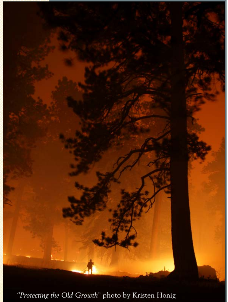
"Protecting the Old Growth"

Just a few weeks before they perished on the Yarnell Hill fire, the Granite Mountain Hotshots worked through the night to protect an historic old growth forest and cabins during the Thompson Ridge fire on the Valles Caldera National Preserve.