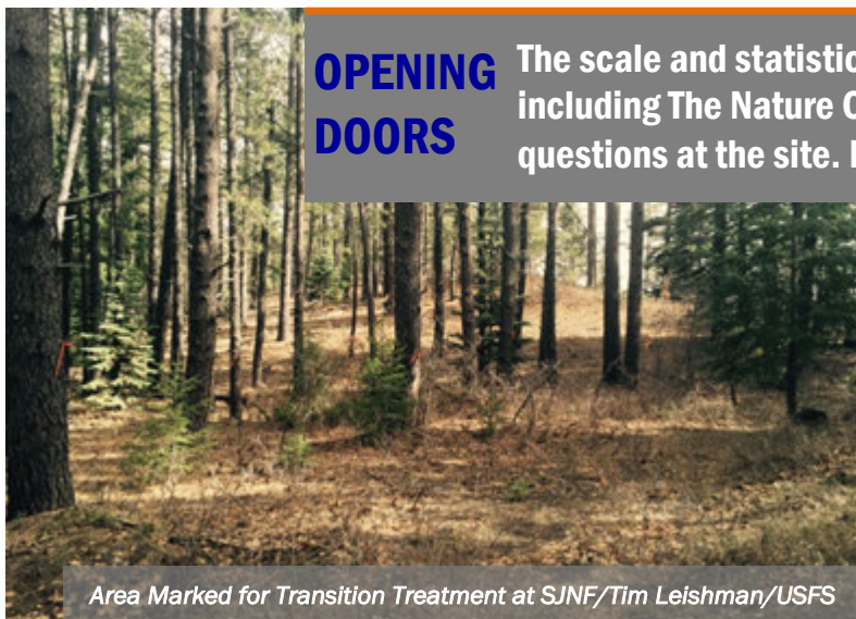
Area Marked for Transition Treatment at SJNF

The scale and statistical rigor of this project will allow other researchers, including The Nature Conservancy and USDA, to pursue related research questions at the site. For example, how treatments will affect snowpack.